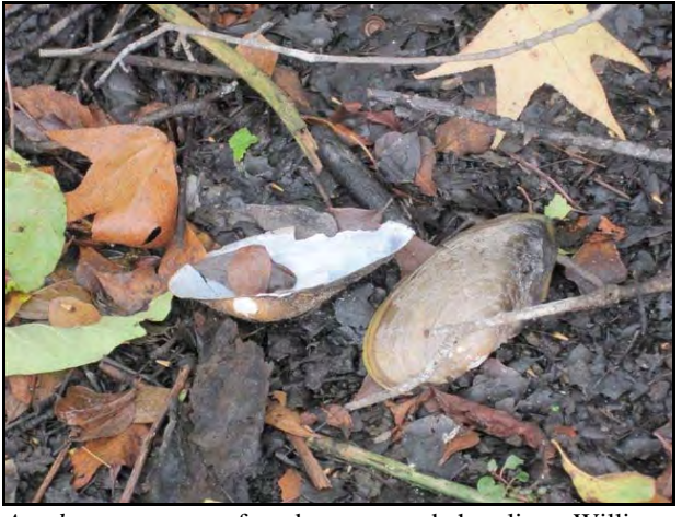
Anodonta cataracta found on exposed shoreline. Williams Pond, Seaford, Delaware.